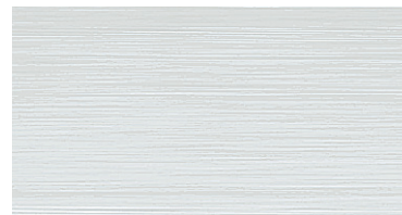
FLUSH PANEL WITH WOODGRAIN EMBOSSMENT