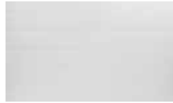
PENCIL GROOVE PANEL WITH STUCCO EMBOSSMENT