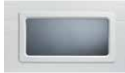
24" X 12" INSULATED GLASS Available with either a black or white frame.