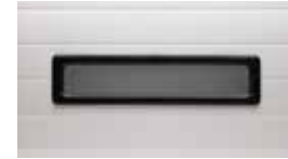
24" X 6" DOUBLE INSULATED ACRYLIC WINDOWS WITH BLACK FRAME