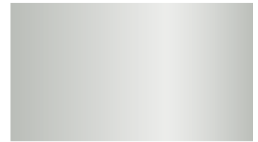
ALUMINUM & INSULATED ALUMINUM