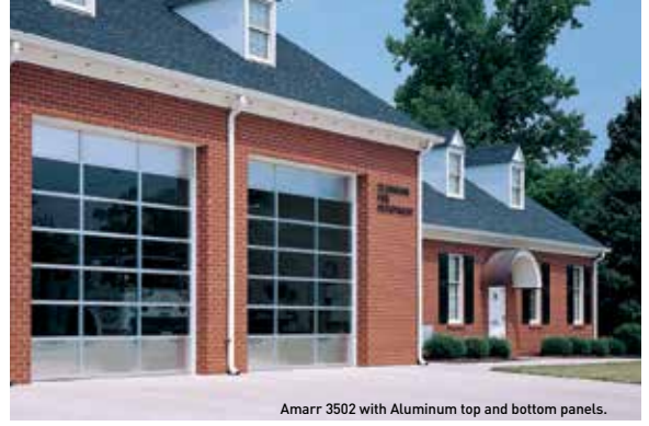
Amarr 3502 with Aluminum top and bottom panels.

The ClearView Aluminum Strut System provides added strength and durability to larger Amarr 3552 door sizes up to 24' 2", without restricting the viewing area.