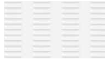
LOUVERED ALUMINUM 7 columns of 12] 3" x 3/4" vents on a 4' x 24" panel

*Mill finish only. Custom powder coat available Fall 2015