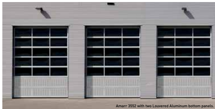
Amarr 3552 with two Louvered Aluminum bottom panels.